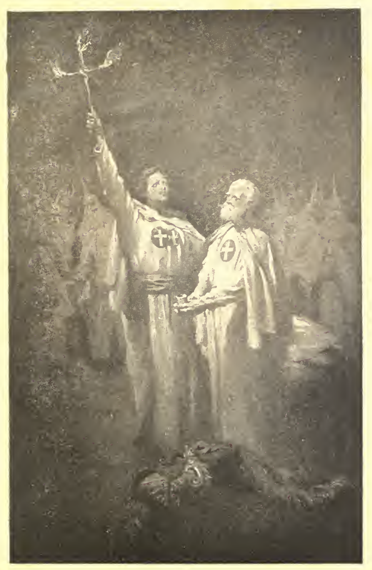
"'The Fiery Cross of old Scotland's hills!""